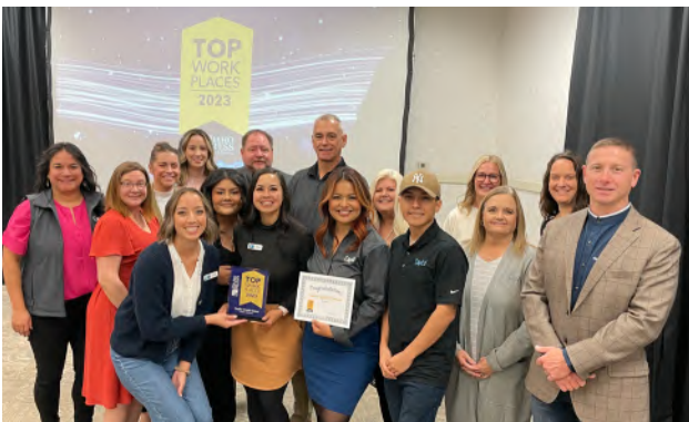
Pictured Above: Team members celebrating CapEd's award for Idaho Press Top Workplace.

Each year, CapEd's Business Plan goals center around financial stability, member growth, organizational excellence, and member and community experience. The Business Plan strategies are designed to achieve the goals and objectives in these areas, which in turn advance the Mission and Vision of CapEd. In 2023, CapEd was successful in opening its 11th branch on Cleveland Blvd. in Caldwell. I am happy to report that this branch is performing very well in serving our Caldwell and surrounding area members' financial service needs. We continue to gather new members to join with the over 106,000 current CapEd members at all branch locations, and